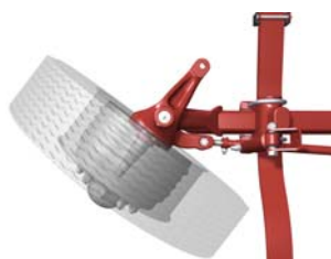
Optimized steering system — 55-degree wheel cut